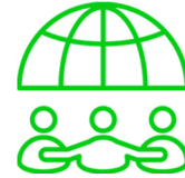
GROUP/CENTRE BASED TASKS