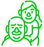
DAILY LIVING ASSISTANCE