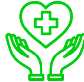
HEALTH & WELL-BEING